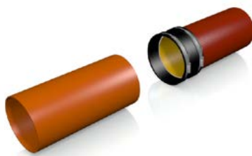
Slide coupling over one plain end.