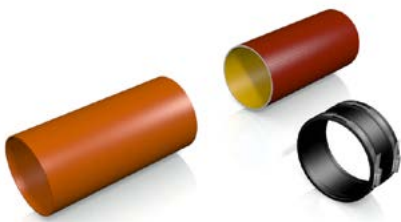
Position plain ended pipes.