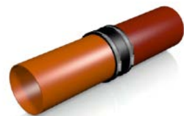
Center coupling over joint. Tighten clamps.