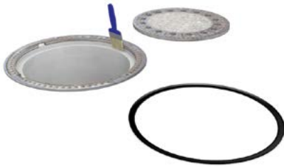
Clean cover frame.